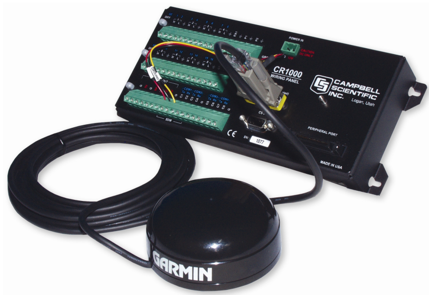
FIGURE 3. CR1000 to GPS16-HVS Using the 17218 Adapter