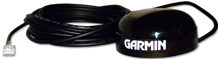
FIGURE 1. Garmin 16-HVS GPS Receiver, Part Number 17215